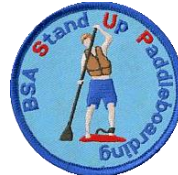
Stand Up Paddleboarding BSA