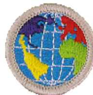
Citizenship in the World