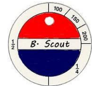
Non-Swimmer/ Beginner Instruction