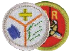
Emergency Preparedness/ Search & Rescue