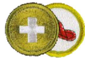
Safety/ Fire Safety