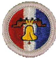
Citizenship in the Nation