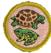
Reptile & Amphibian Study