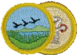
Fish & Wildlife Management/ Mammal Study