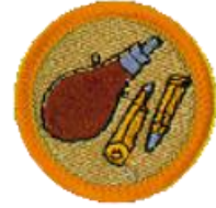
Advanced Rifle Shooting